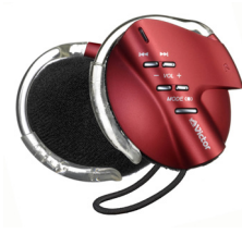
R: Metallic Red